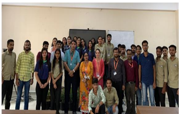
Group photo of students and faculty