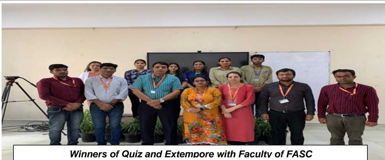
Winners of Quiz and Extempore with Faculty of FASC